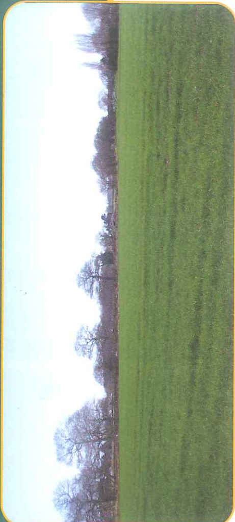
View of the fields that will be destroyed.